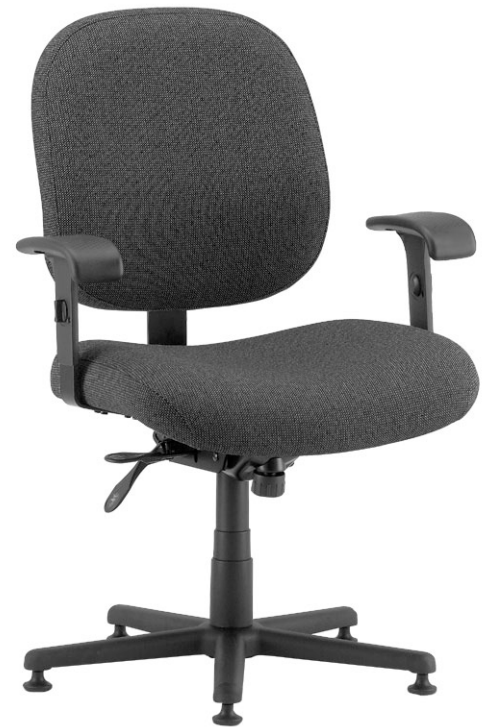
Model 10,000 Industrial with optional armrest and polyurethane arm pads